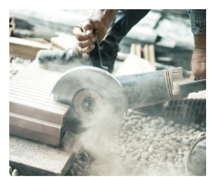
Dust in the wind. But not in the bearing